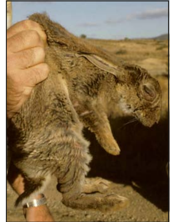
Rabbit with myxomatosis.