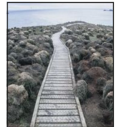
Tussock vegetation on Macquarie island destroyed by rabbits.

RFA applauds both Ministers, and the Tasmanian and Commonwealth Governments, for their commitment to protect Macquarie Island for future generations.