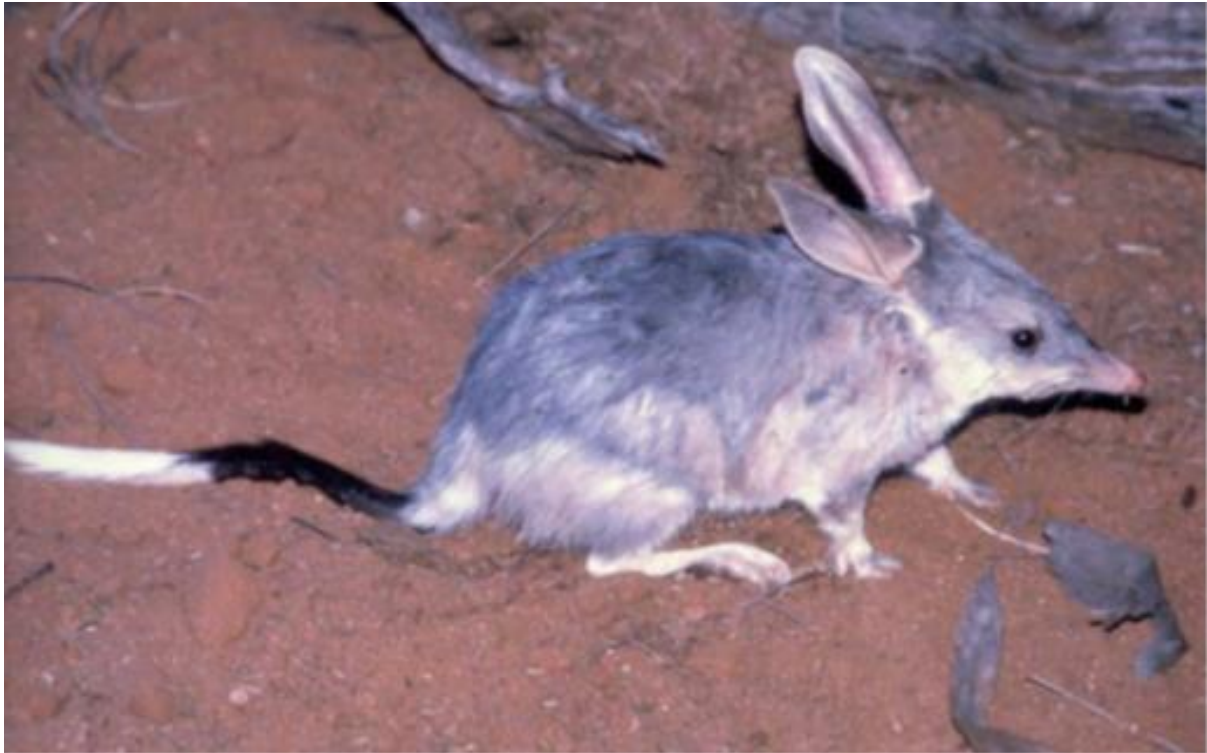
Greater Bilby.

The greater bilby ( Macrotis lagotis ) is a small (rabbit sized) marsupial from Australia's bandicoot family. It has a pointed snout, long pinkish ears, a long black tail with a white tip, and strong forelimbs and claws for burrowing and digging up food. Males are much larger than the females and can be up to 2.5 kg in weight. Each bilby moves between up to 12 burrows in their home range in response to food availability.