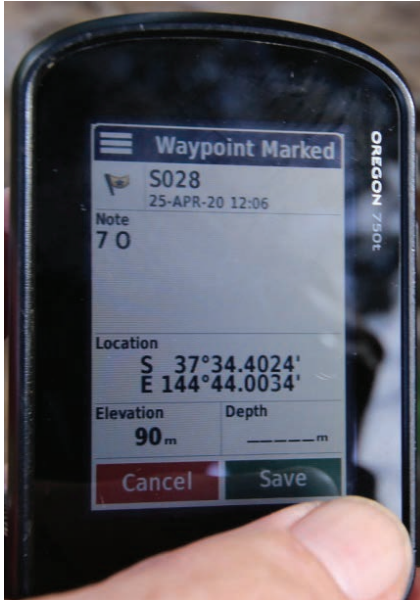
Figure 3: Collecting GPS data GPS recording unique warren ID S028, number of burrows (7) and activity (O=open)

A GPS (Figure 3) can be used to record warren location and numbers, and to note the control measures required for each. The GPS data and map (Figure 4) generated from the GPS will guide contractors doing burrow modification (e.g. excavator, bulldozer or implosion). You can then use the GPS to track the works, ensuring all burrows are treated.