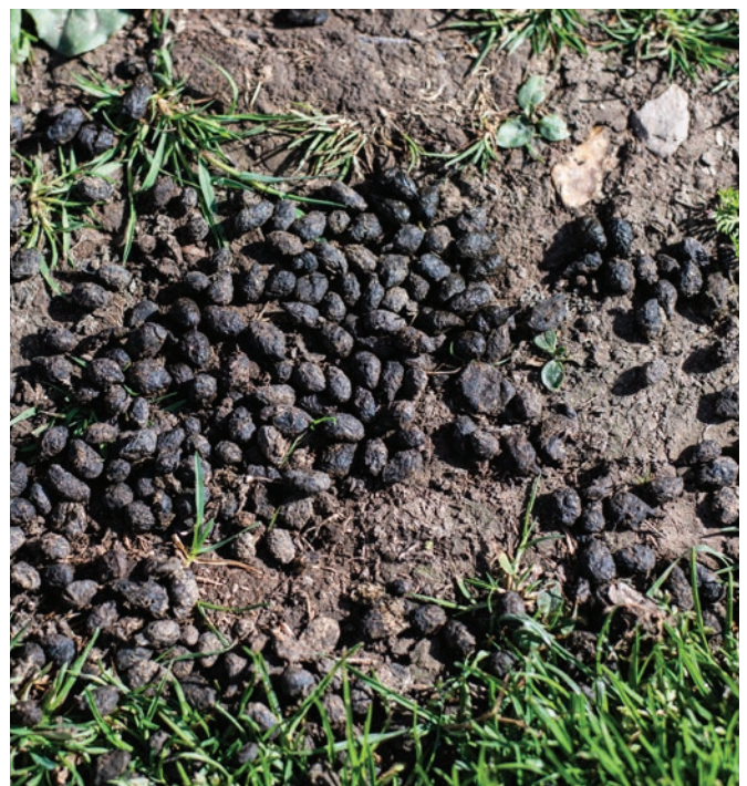
Figure 2: Evidence of fresh rabbit dung