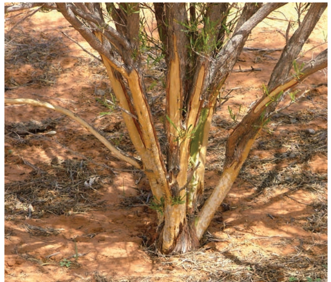
Figure 1: Damaged vegetation

You will see evidence of active rabbit behaviour such as fresh new scratchings (freshly turned soil), fresh dung (black and shiny), reopened or new burrows created, vegetation attacked, and crops grazed (See Figure 1 & 2). In time, more burrows will be reopened or dug.